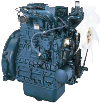
Photograph may show non-standard equipment.